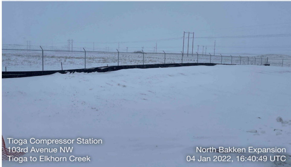
Tioga Compressor Station 103rd Avenue NW Tioga to Elkhorn Creek

LAT: 48.403305 LON: -102.905077 ±13ft ▲ 2282ft