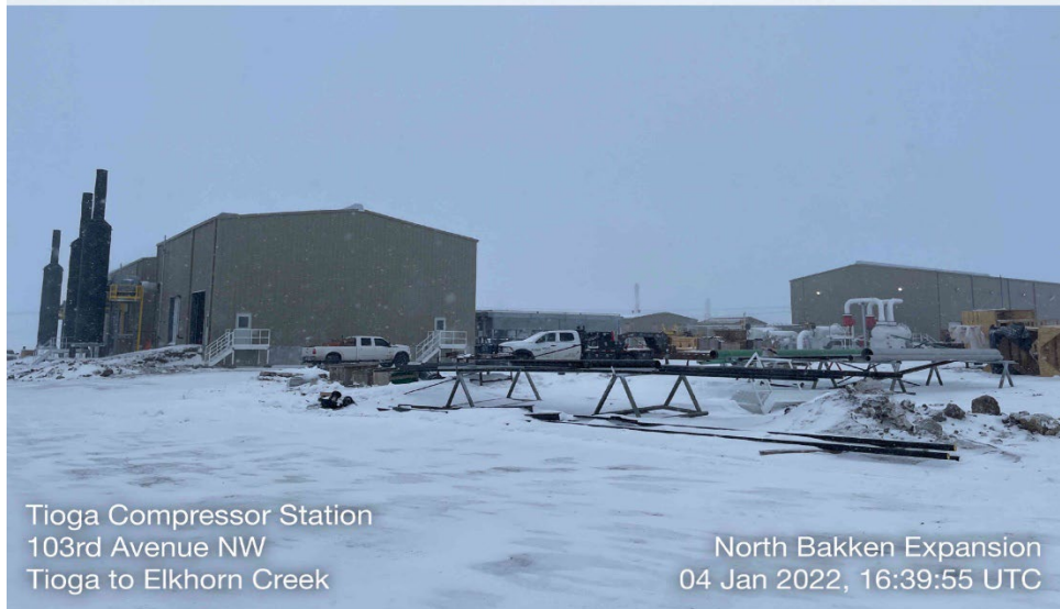
Tioga Compressor Station 103rd Avenue NW Tioga to Elkhorn Creek

LAT: 48.404355 LON: -102.905140 ±22ft ▲ 2277ft