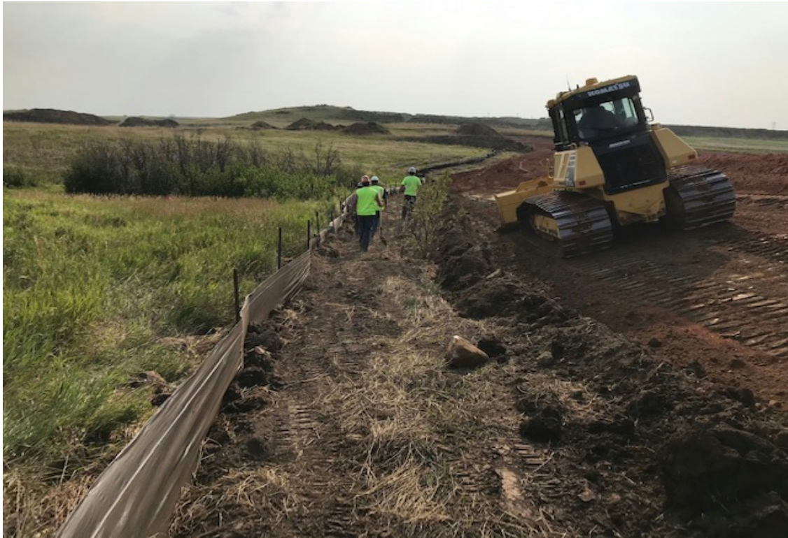
View of cut and fill activities at the Elkhorn Creek Compressor Station.