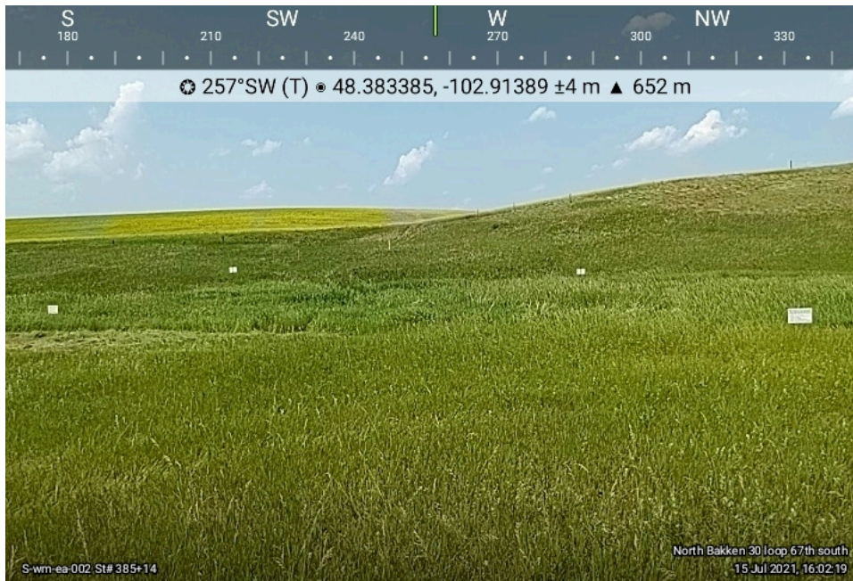
View of resource signs installed at waterbody s-wm-ea-002 along the Line Section 30 Loop.