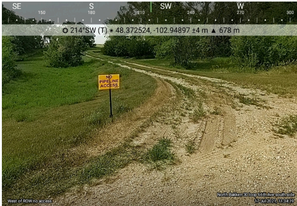
View of No Access sign installed at 66 th Avenue along the Line Section 30 Loop.