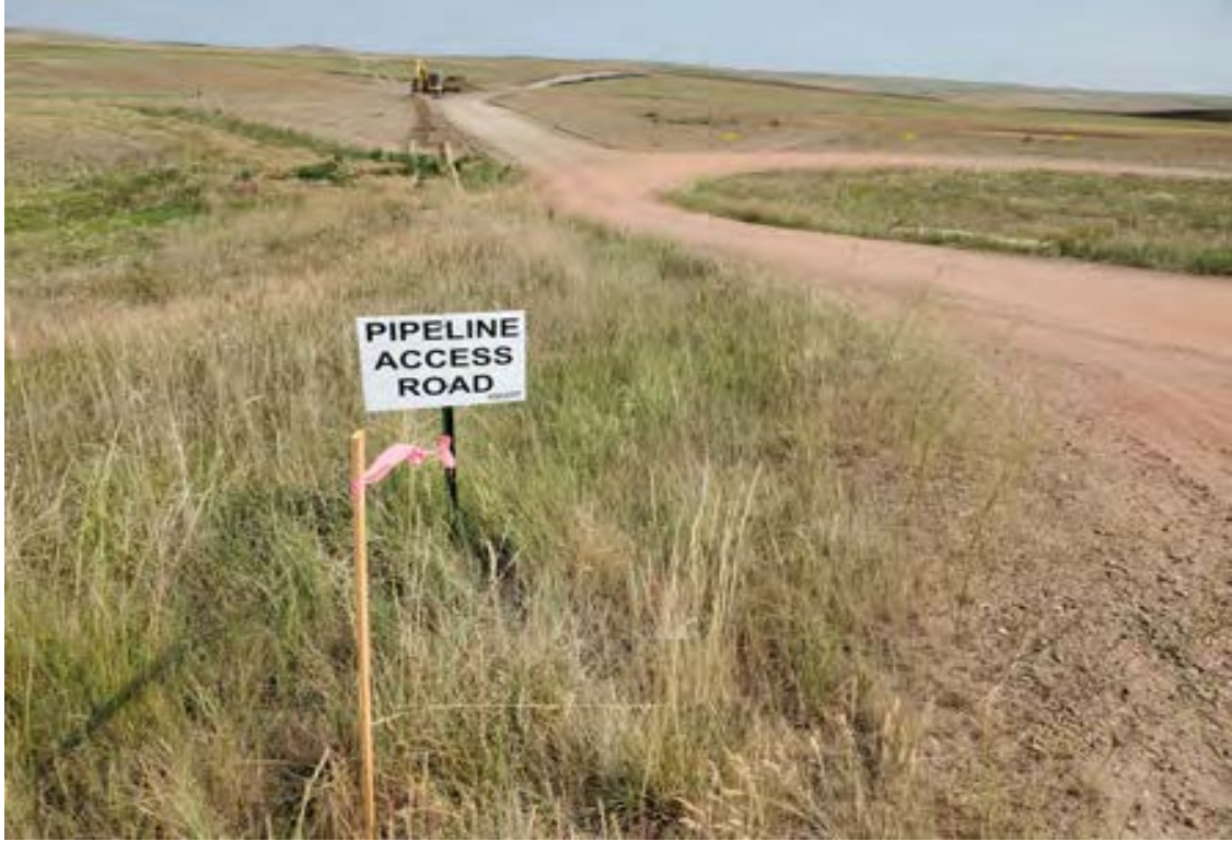
View of Access Road sign installed at the Elkhorn Creek Compressor Station.