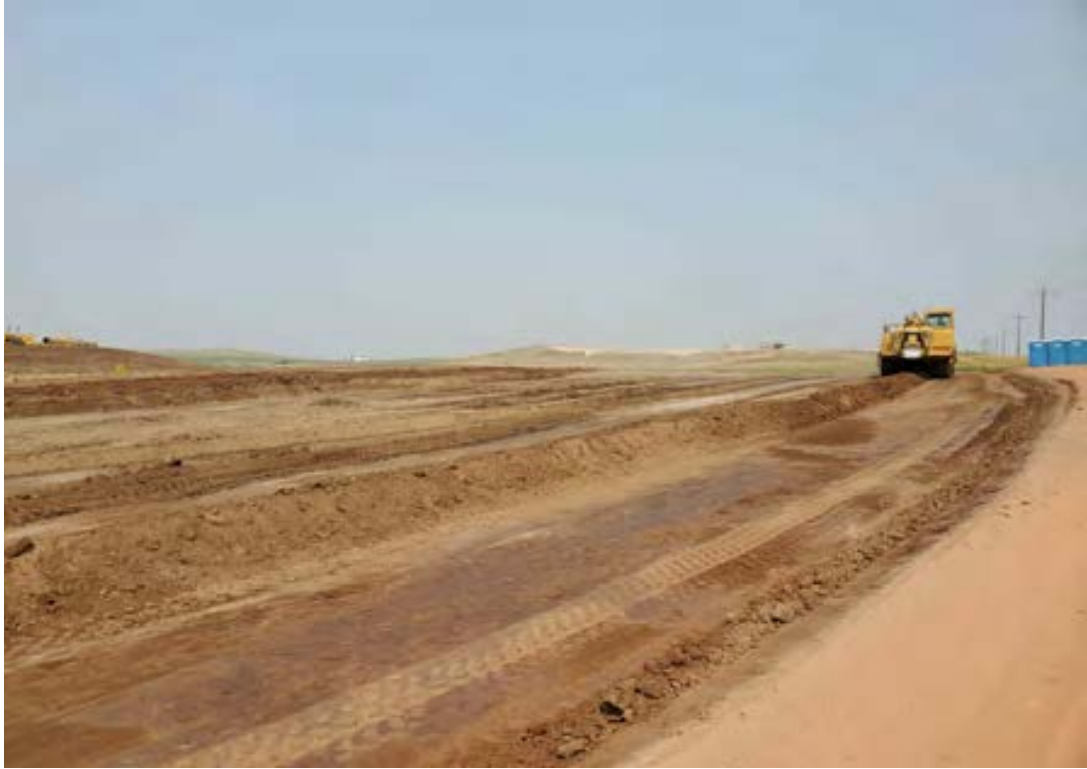
View of grading activity at the Elkhorn Creek Compressor Station.